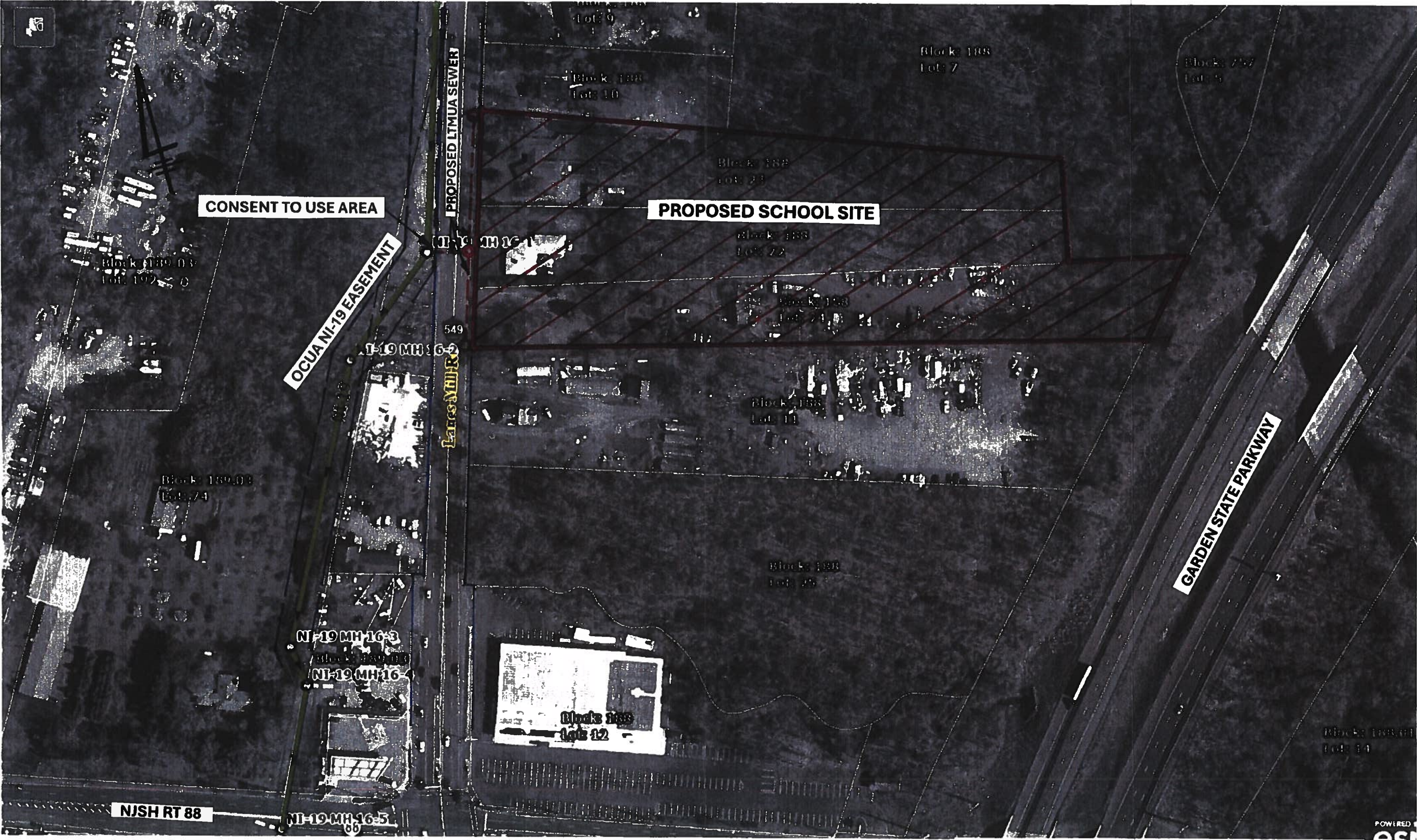
NORTH BRANCH METEDECONK INTERCEPTOR (NI-19)

LAKEWOOD TOWNSHIP MUA – DIRECT CONNECTION TO OCUA NI-19 SEWER